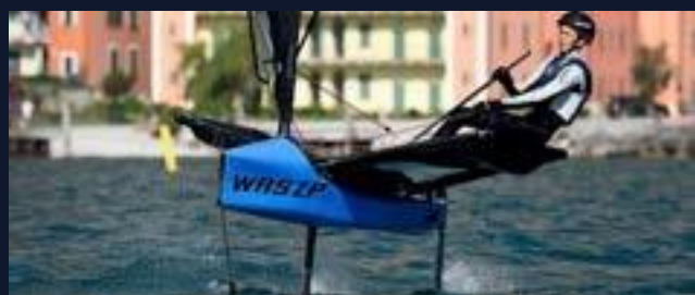
WASP WORLDS 2017