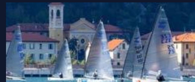
FINN EUROPEANS 2023