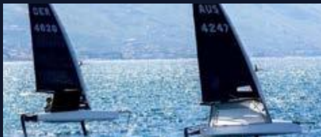
MOTH WORLDS 2012