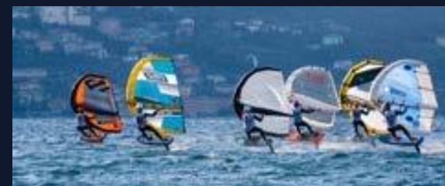
WINGFOIL EUROPEANS 2022