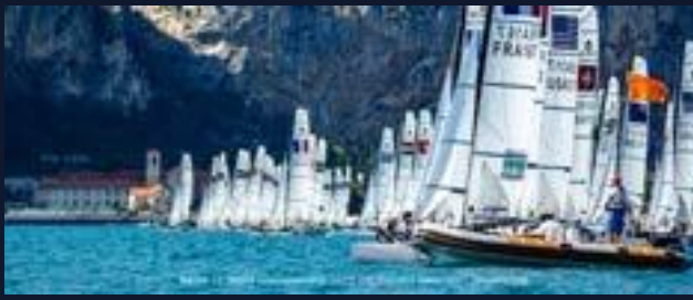
NACRA 15 WORLDS 2022