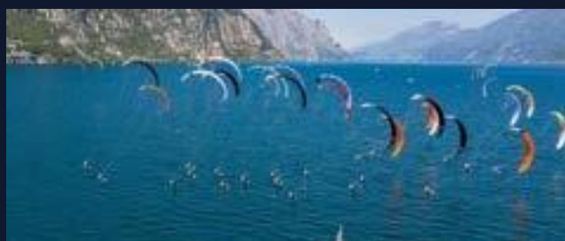
FORMULA KITE WORLDS 2019