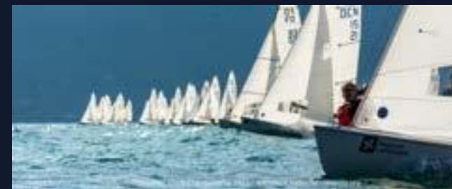
FLYING DUTCHMAN WORLDS 2022