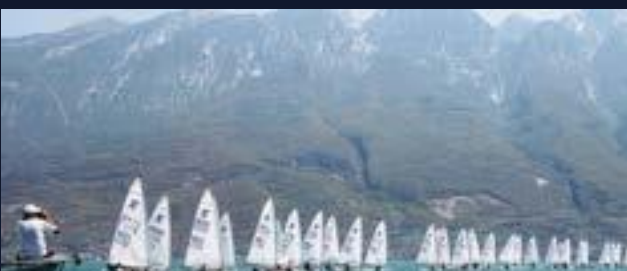
SPLASH EUROPEANS 2022