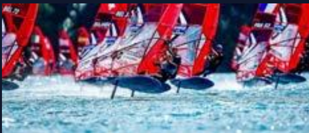
IQFOIL WORLDS 2021